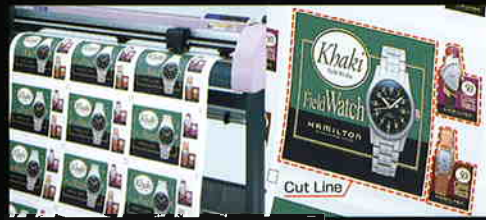
Cutting with the CG-FX series as a Print-cut solution