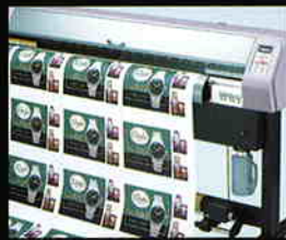
Nesting with the Inkjet plotter JV3 series