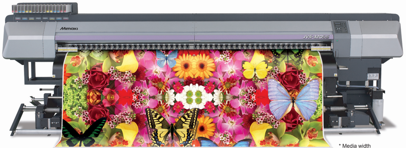
* Media width